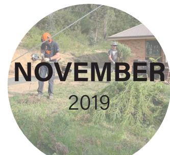
Volunteers gathered for a working bee to do some much-needed maintenance at Glendale.