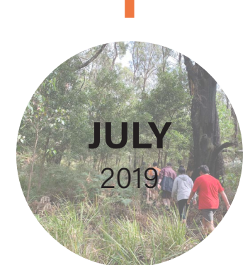
The Annual Brekky Creek Camp was a smash hit with all our campers.