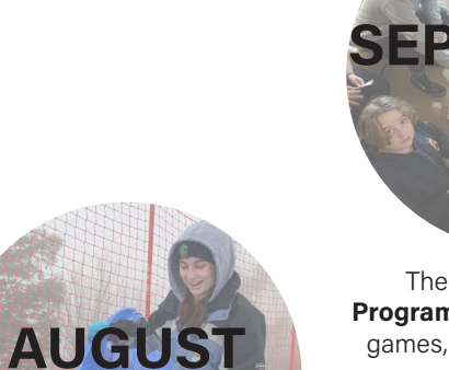
The temperature dropped, but spirits soared in the cold winter weekend camps.