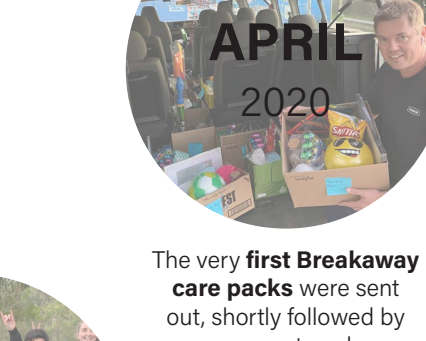
out, shortly followed by more support packages for youth and families.